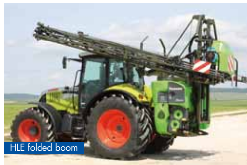
HLE folded boom